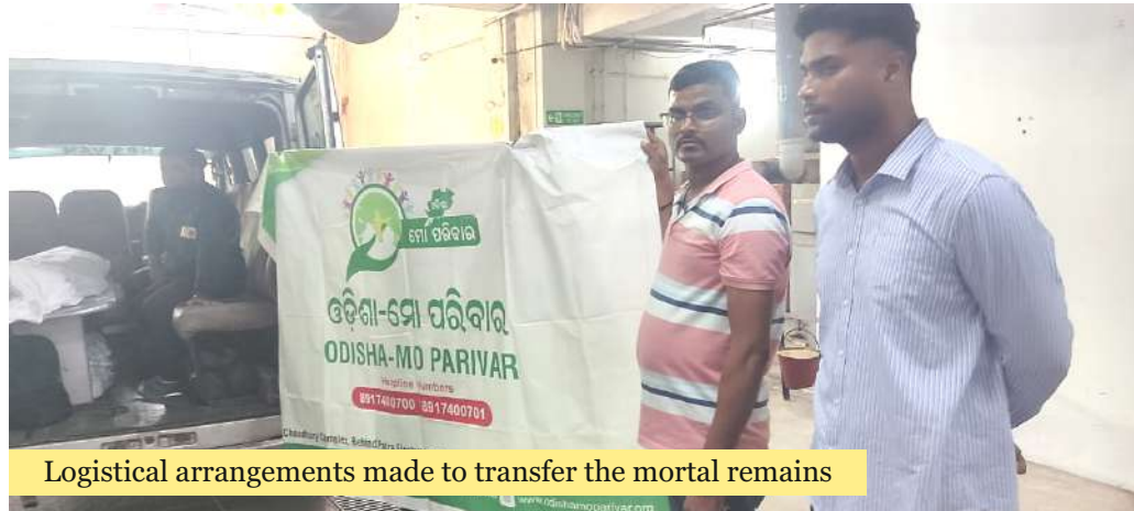
Logistical arrangements made to transfer the mortal remains