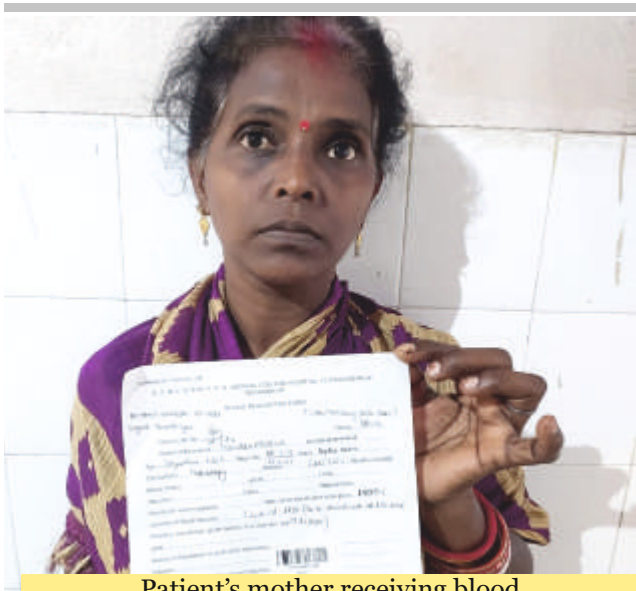
Patient's mother receiving blood