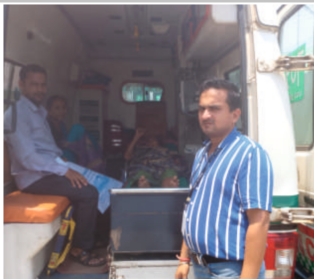
Logistical arrangement made to shift the patient