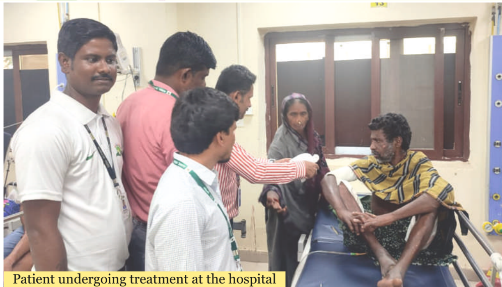
Patient undergoing treatment at the hospital