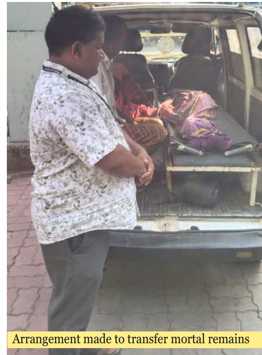
Arrangement made to transfer mortal remains