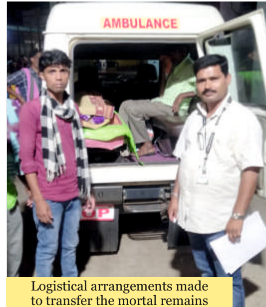
Logistical arrangements made to transfer the mortal remains

Baikuntha assisted the family with the necessary hospital procedures and facilitated the transfer of the deceased's remains from the hospital to their native place.