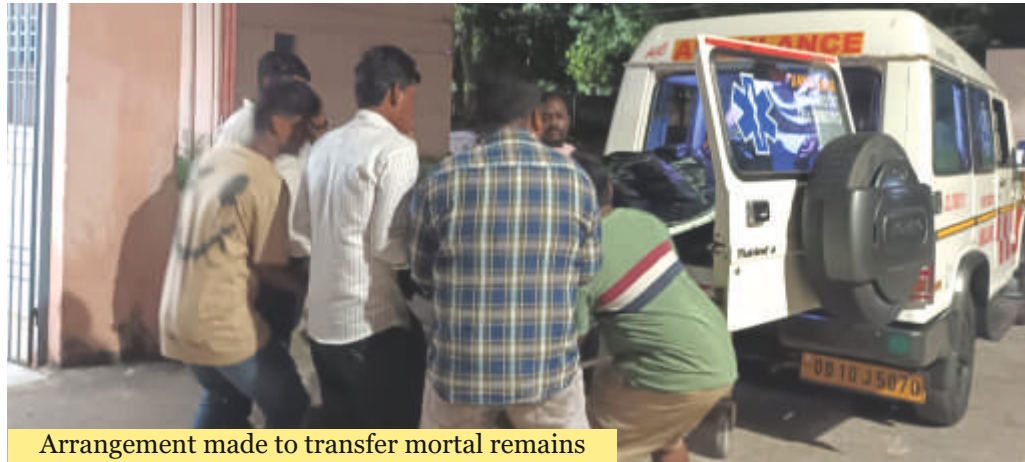
Arrangement made to transfer mortal remains

Unfortunately, they succumbed to their injuries. Upon receiving the news of their demise, their family was completely shattered. Burdened with financial difficulties, the family approached Odisha-Mo Parivar seeking help