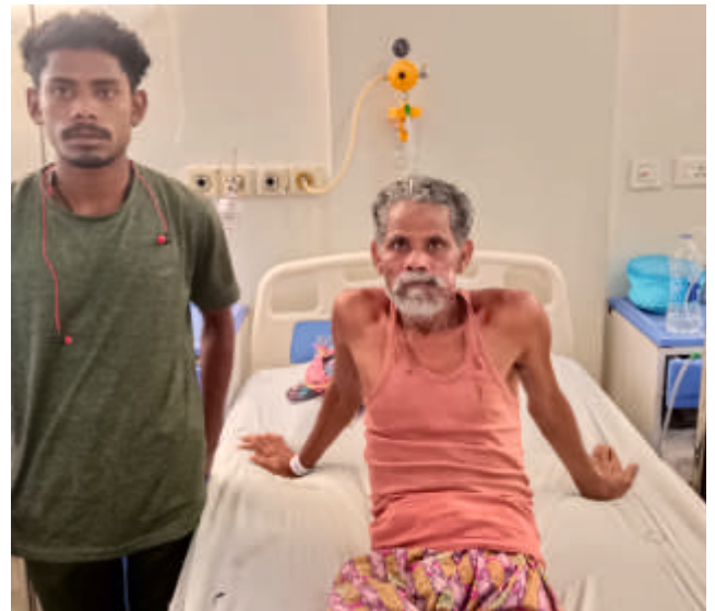
Patient undergoing treatment