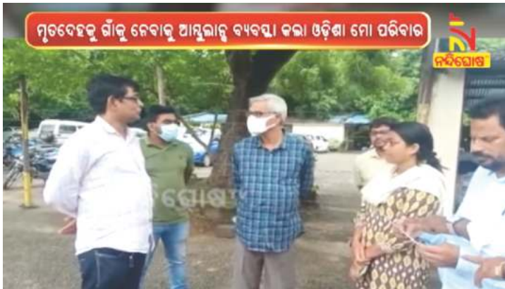
Mortal remains received at Airport, covered by Nandighosh TV