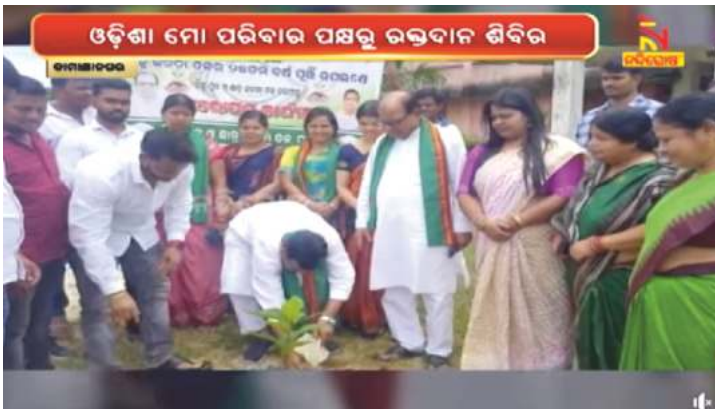
Blood donation camp & plantation drive, Covered by Nandighosh TV