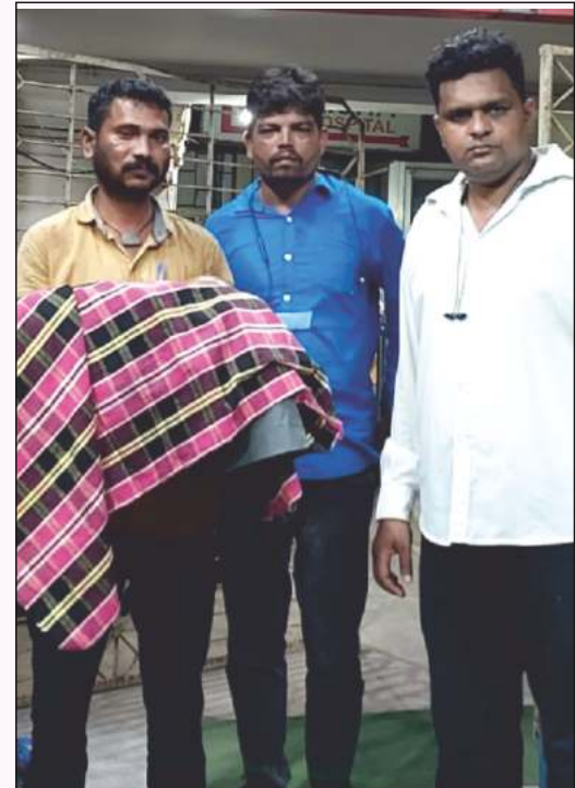
Mortal remains handed over to the family