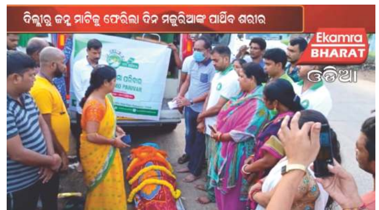
Mortal remains received by Odisha Mo Parivar: Covered by Ekamra Bharat