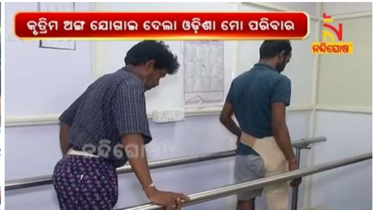
Provision of prosthetics by Odisha Mo Parivar, Covered by OdishaFast