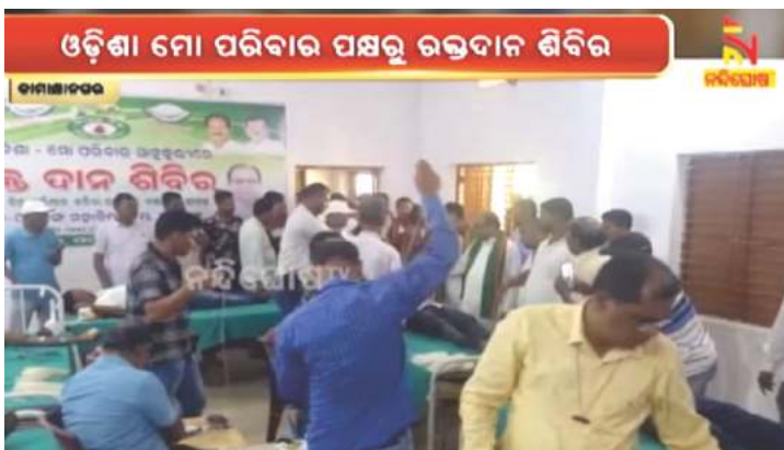
Jeevan Bindu blood donation camp, Covered by Nandighosh TV