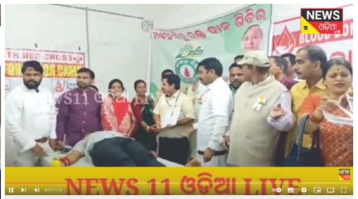
Jeevan Bindu blood donation camp, Covered by News11 Odia