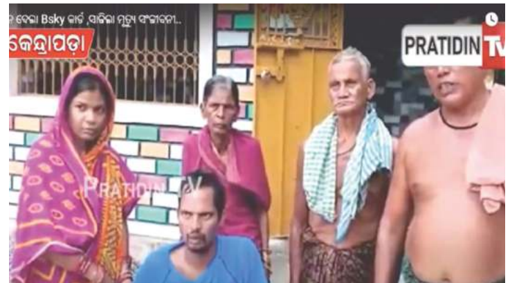
Help provided under BSKY scheme, Covered by Pratidin TV