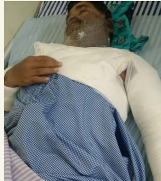
Patient undergoing treatment