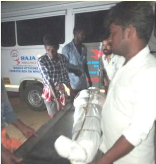
Mortal remains being transferred to native place

Upon getting the information from Odisha-Mo Parivar twitter handle, the matter was escalated to MLA Office, Nuapada, which was further coordinated with the DLO, Nuapada. With the active response of the DLO, the mortal remains were transferred from Tamil Nadu to Nuapada and MLA Nuapada stood by the bereaved family during the last rites.