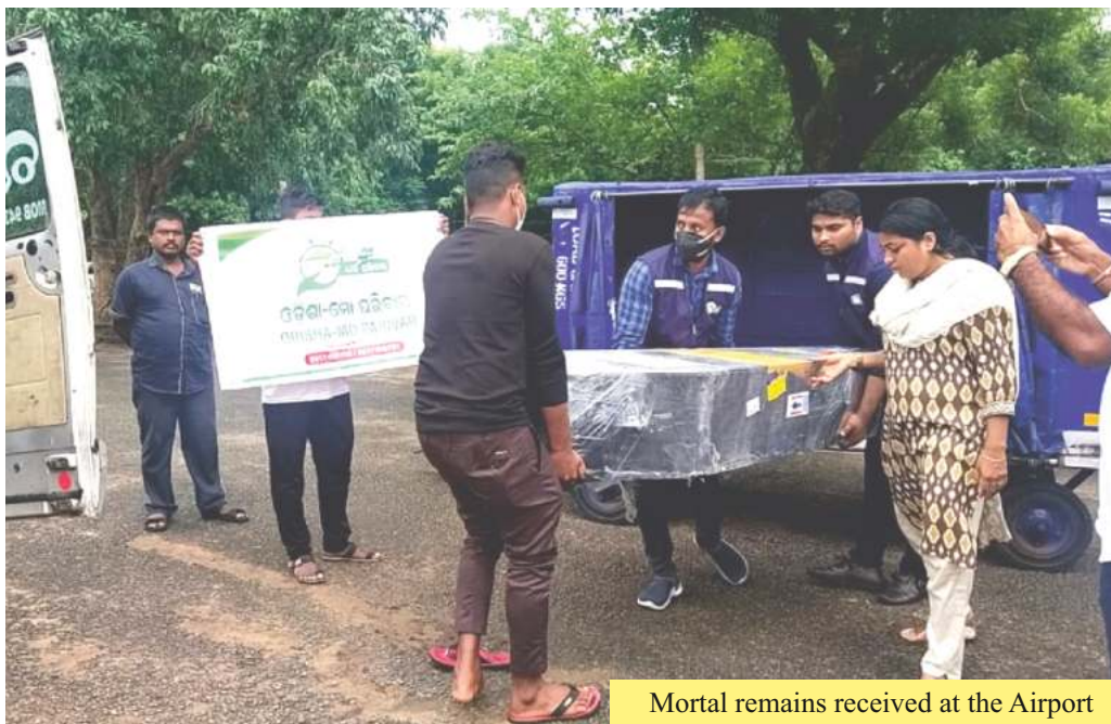
Mortal remains received at the Airport

Upon getting the information, the team reached at the airport, received the mortal remains and made required arrangements to transfer the mortal remains to their native place at Ganjam.