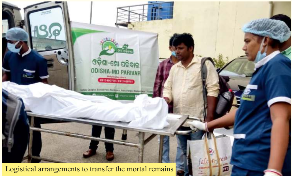
Logistical arrangements to transfer the mortal remains

logistical arrangements to transfer the mortal remains from the hospital to their native place at Golabadha, Ganjam.