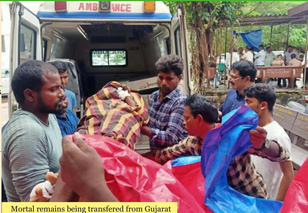
Mortal remains being transferred from Gujarat