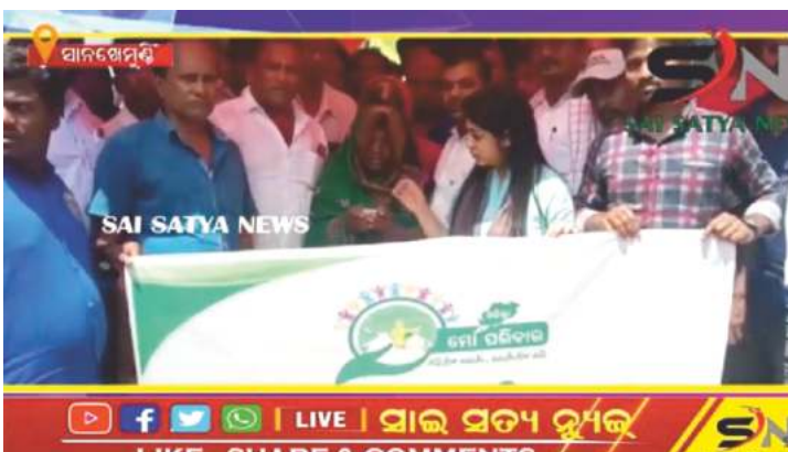
Standing by the bereaved family during rituals, Covered by SN TV