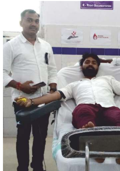
Donor arranged by Himansu at DHH, Bhawanipatna for a sickle cell patient