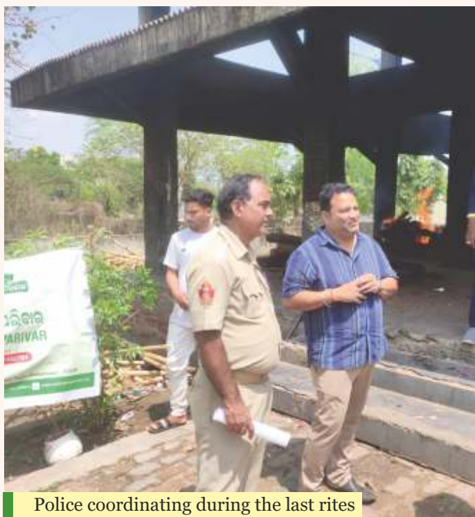
Police coordinating during the last rites

2 A lady was found roaming near Capital Hospital area who was rescued by the staffs of Patita Udhara Samiti on 21st March in the morning and same day in the evening she had a chest pain and was brought to the Capital Hospital for check-up but unfortunately she breathed her last. This was informed to the Capital Police Station by the staff of Patita Udhara Samiti. Since there was no identity of the lady and no claimant, the body was kept in the mortuary for 96 hours.