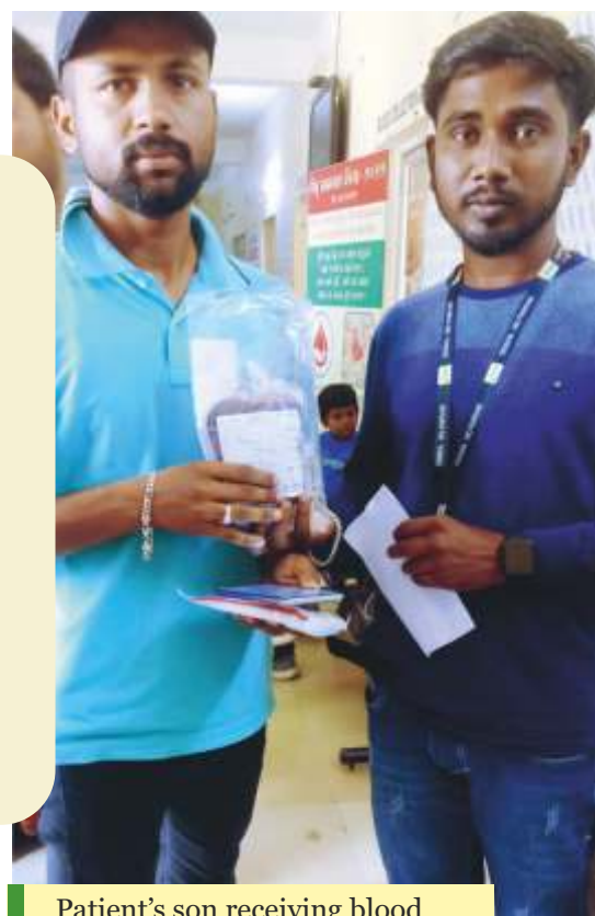
Patient's son receiving blood