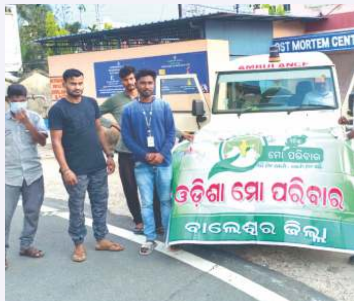
Logistical arrangements made to transfer the mortal remains

Unfortunately, he was declared dead at the hospital due to a cardiac arrest. Since, he was travelling