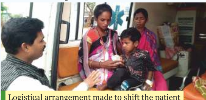
Logistical arrangement made to shift the patient