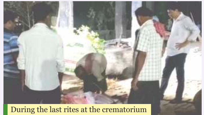
During the last rites at the crematorium