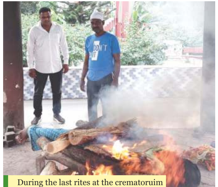
During the last rites at the crematorium