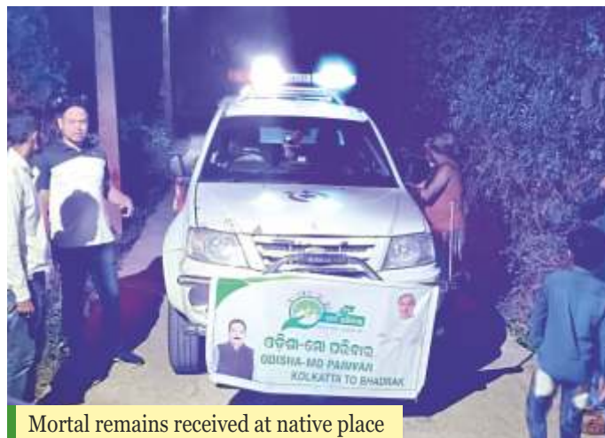
Mortal remains received at native place