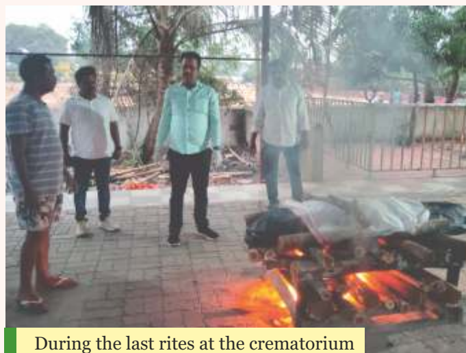
During the last rites at the crematorium