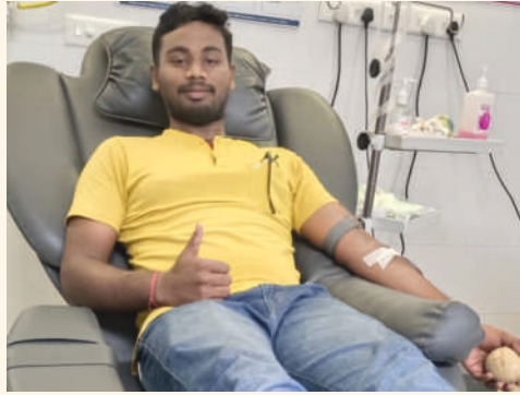
Donor arranged for a blood cancer patient at AIIMS by Odisha Mo Parivar