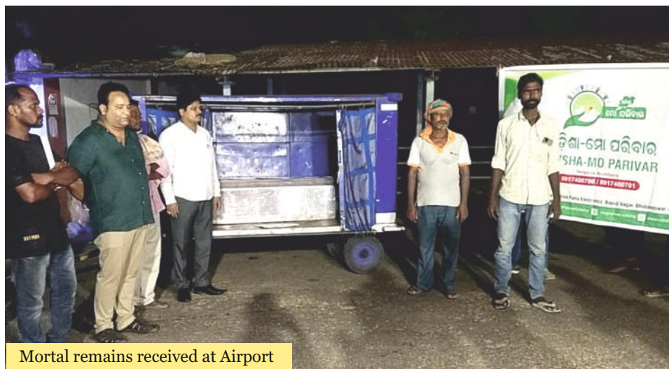
Mortal remains received at Airport