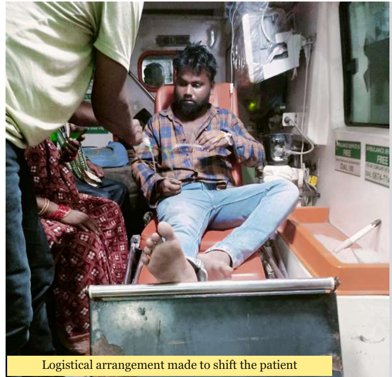
Logistical arrangement made to shift the patient