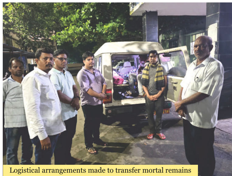
Logistical arrangements made to transfer mortal remains