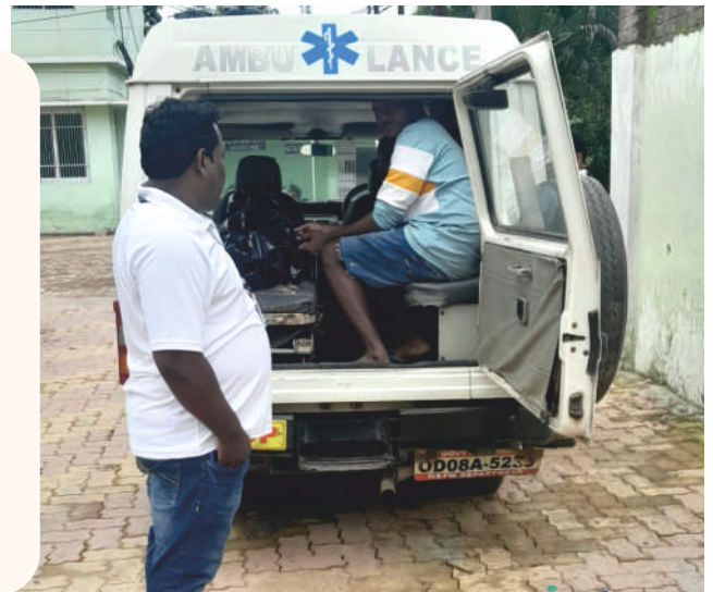
Logistical arrangement made to transfer mortal remains