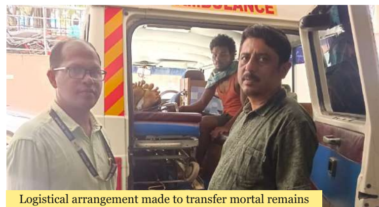
Logistical arrangement made to transfer mortal remains