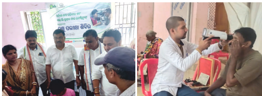
Eye Checkup Camp by Odisha-Mo Parivar