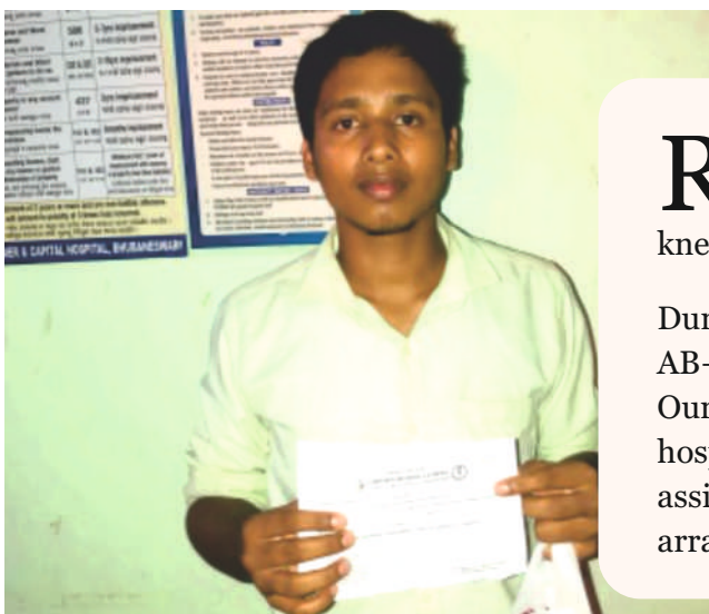
Patient's son receiving blood at the hospital