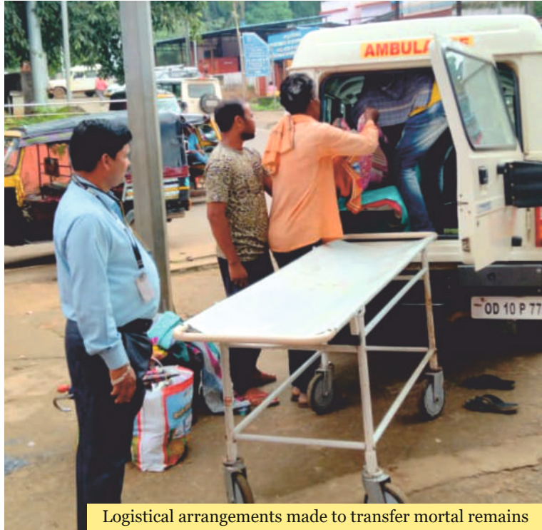
Logistical arrangements made to transfer mortal remains