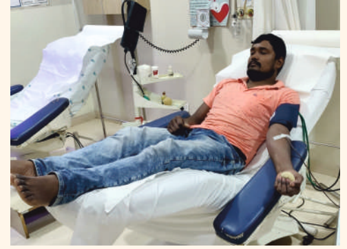
Donor arranged for a CKD patient at Apollo hospital by Odisha Mo Parivar