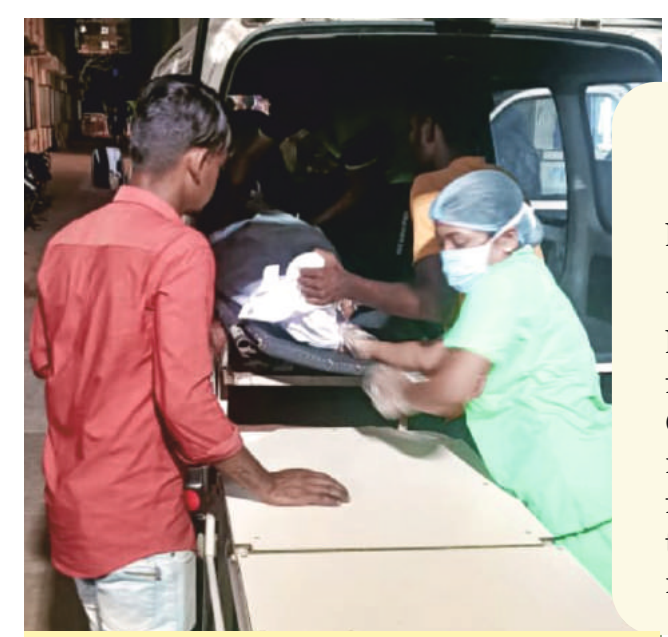
Logistical arrangement made to transfer mortal remains