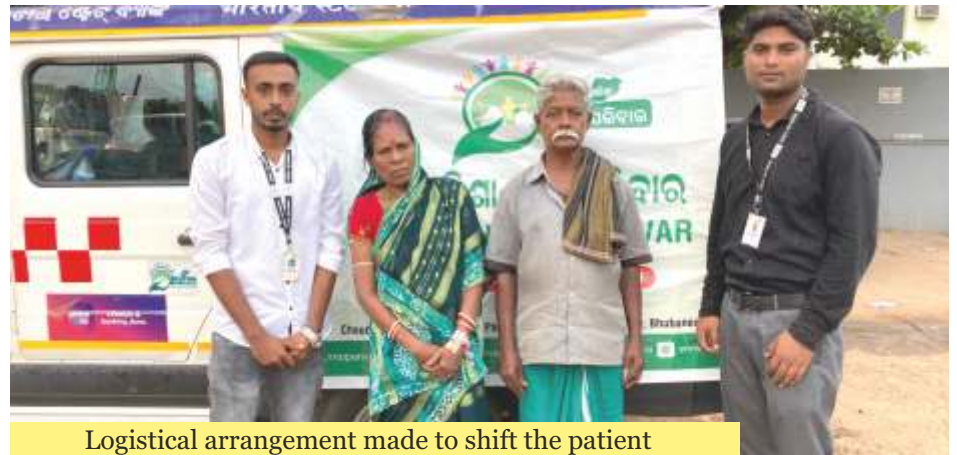
Logistical arrangement made to shift the patient