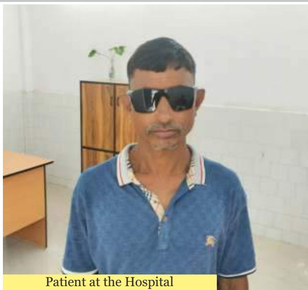
Patient at the Hospital