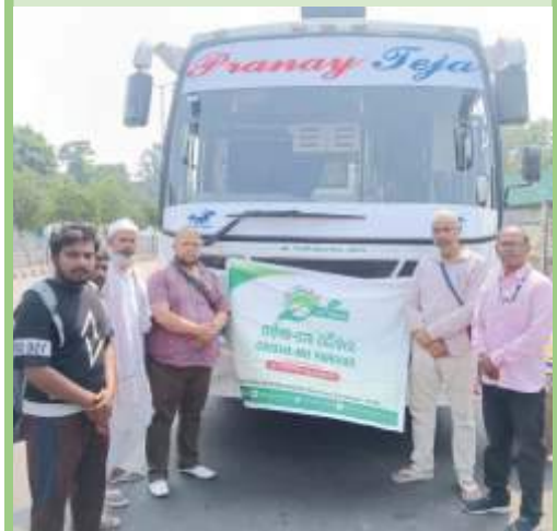
Arrangement made to shift the passengers