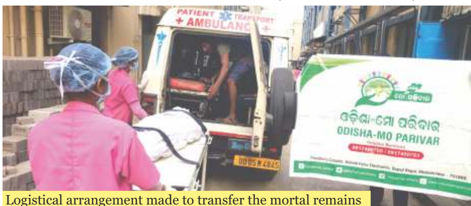
Logistical arrangement made to transfer the mortal remains