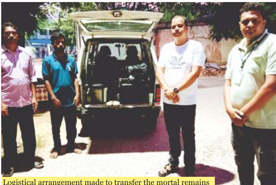
Logistical arrangement made to transfer the mortal remains