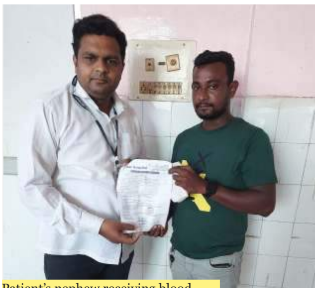
Patient's nephew receiving blood