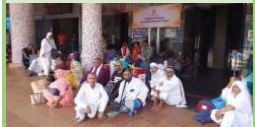
Passengers waiting at the railway station