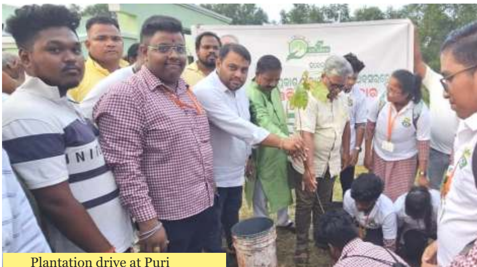
Plantation drive at Puri