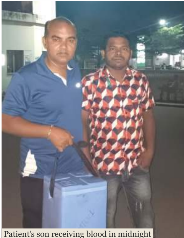
Patient's son receiving blood in midnight