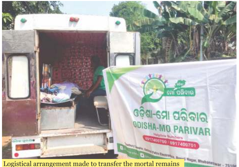
Logistical arrangement made to transfer the mortal remains

arrangements to transfer the mortal remains to Puri Swarga Dwara for the last rites.