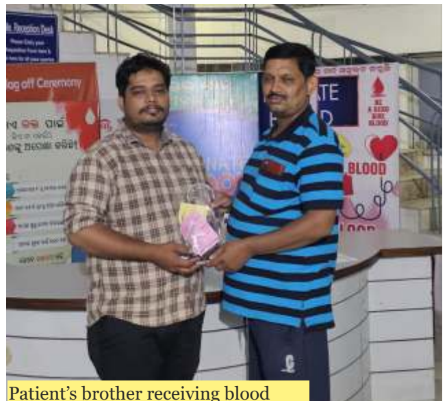
Patient's brother receiving blood

During the course of the treatment, there was an urgent need of rare AB+ve blood and the family approached Girija to help them in arranging blood and Girija arranged the required unit of blood in the right time.