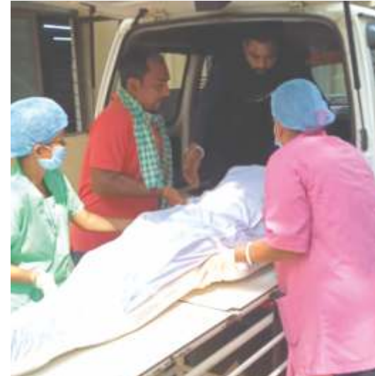
Logistical arrangements made to transfer the mortal remains