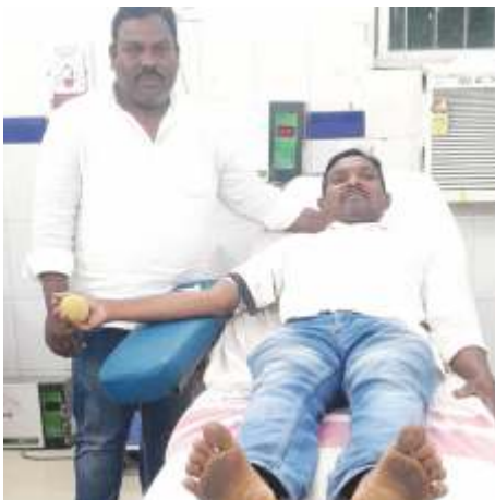
Donor arranged for surgery of a patient at DHH Bhawanipatna