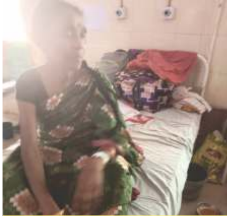
Patient undergoing treatment at the hospital