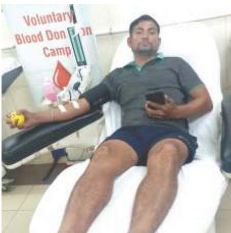
Donor arranged for a patient at KIMS Hospital