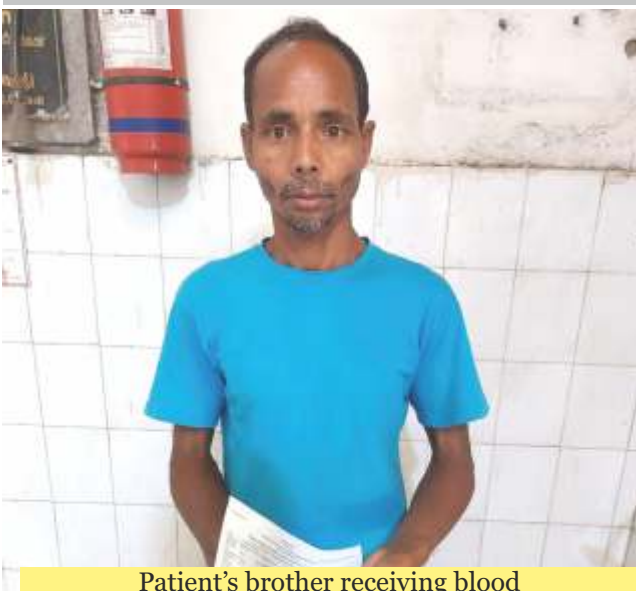
Patient's brother receiving blood