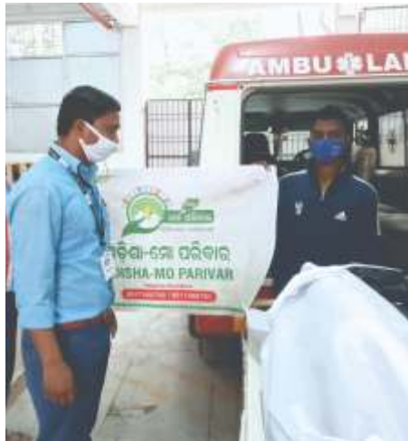
Logistical arrangements made to transfer the mortal remains