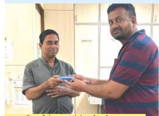
Beneficiary receiving the glasses

Attendees were prescribed reading glasses as well as bifocal glasses which were procured and provided to them. They expressed their gratitude to Odisha-Mo Parivar for this much needed help.