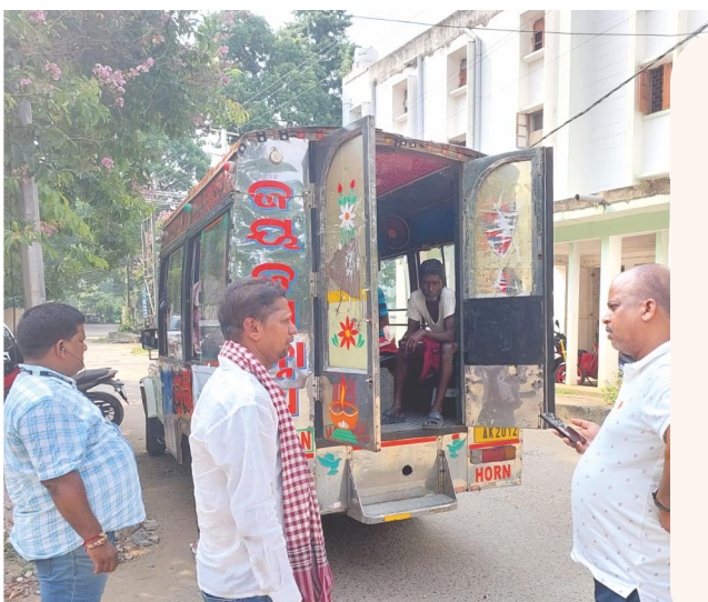
Logistical arrangement made to transfer the mortal remains