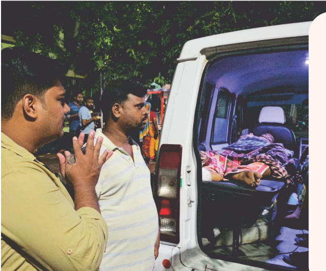
Logistical arrangement made to shift the patients