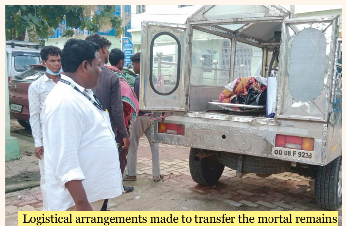
Logistical arrangements made to transfer the mortal remains

hospital procedures. He also helped the family in making logistical arrangements to transfer the mortal remains from the hospital to their residence.