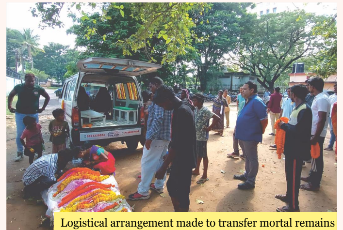
Logistical arrangement made to transfer mortal remains