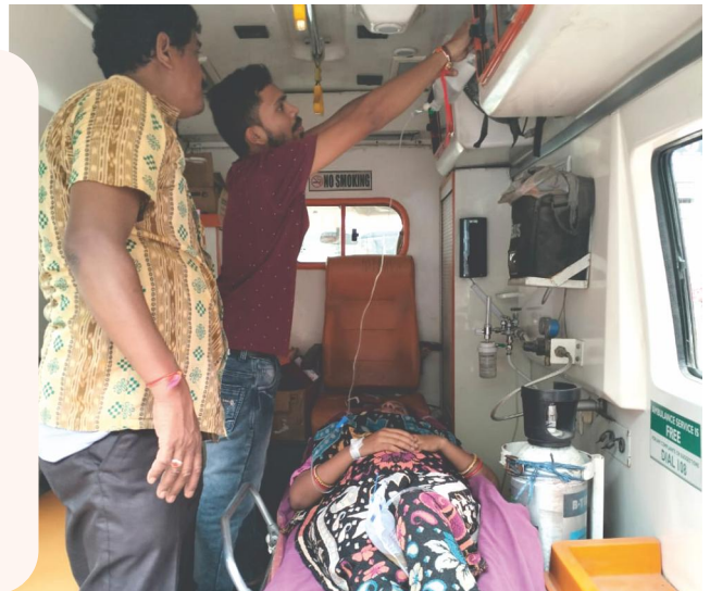
Logistical arrangement made to shift the patient