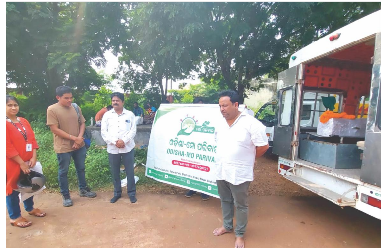
Logistical arrangements made to transfer mortal remains