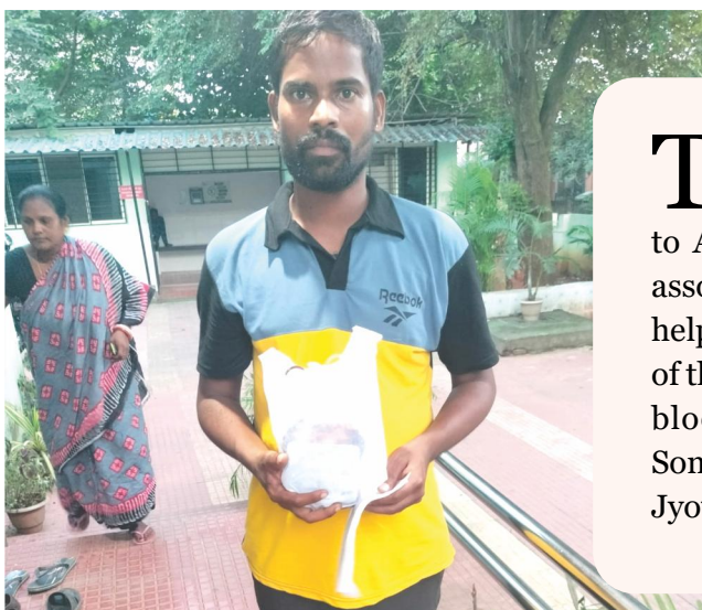
Patient's husband receiving blood at the hospital