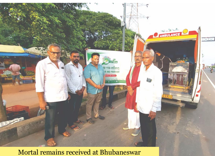
Mortal remains received at Bhubaneswar