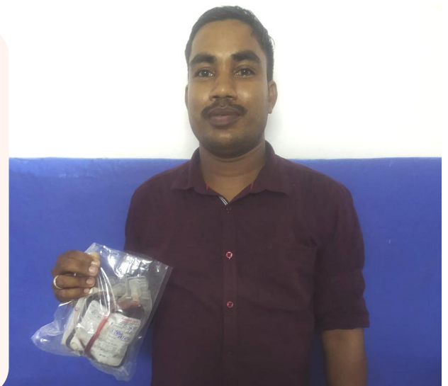
Patient's uncle receiving blood at the hospital