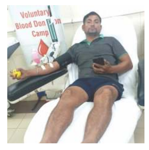
Donor arranged for a patient at KIMS Hospital