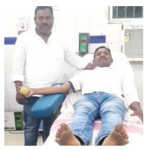
Donor arranged for surgery of a patient at DHH Bhawanipatna