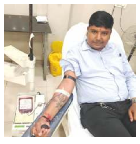
Donor arranged for a patient at Apollo Hospital