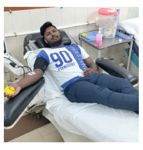
Donor arranged for surgery of a patient at SUM hospital