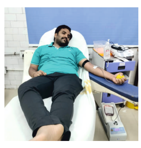
Donor arranged for surgery of a patient at Capital hospital