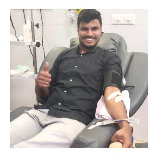
SDP Donor arranged for a Cancer patient at AIIMS hospital